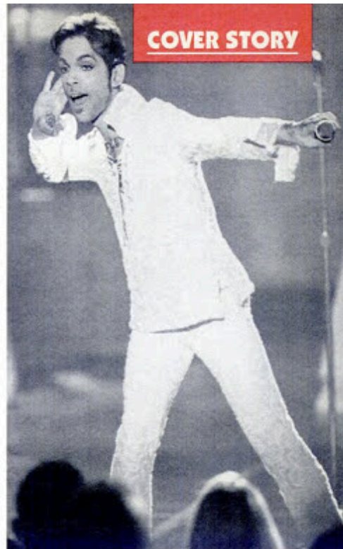
▲ The Artist entertains fans during one of his trademark, spectacular performances at the 4th Annual VH1 Honors in Universal City, CA.

Blacks must own their businesses and control their career growth, The