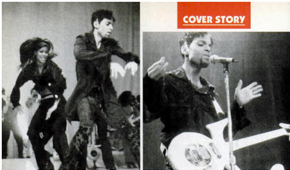
▲The talented musician jams to the joy of his emancipation during the launch party for his album, also titled Emancipation , at Paisley Park Studios in Minneapolis.

Mayte. The baby reportedly died of a rare birth defect.