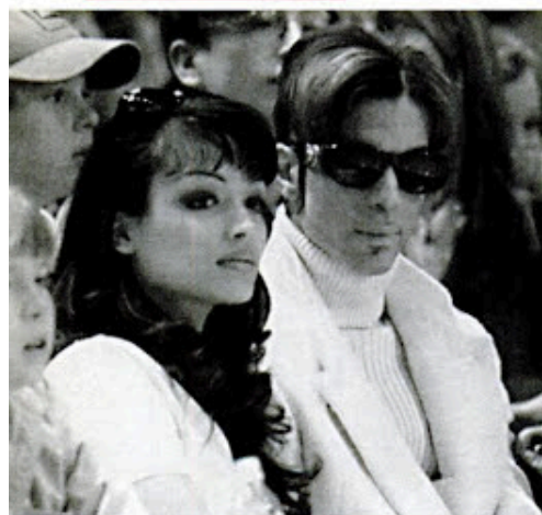
▲Shortly after their wedding in 1996, The Artist and his bride, Mayte, attend a New York Knicks vs. Chicago Bulls game at Madison Square Garden in New York.

says, noting that the three of them "come from the same garden." He notes, "I can't say I have many friends in the music industry."