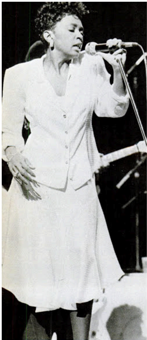
The sultry 4-foot-11-inch recording star enjoys her success and happy love life.