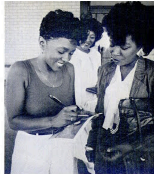
Ms. Baker signs autograph for a fan after a sold-out concert engagement in Chicago.